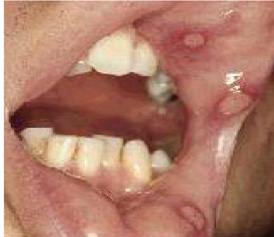
Figure 1. Oral ophthalmic lesions of the patient