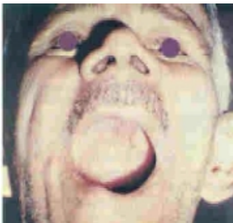
Figure 1. Patient 1: oral mucosal leishmaniasis. Note the ulcer and tumoral mass of soft palate.

day history of lower lip lesion. History of trauma and other medical problems were absent and the lesion had been growing in size over the preceding days.