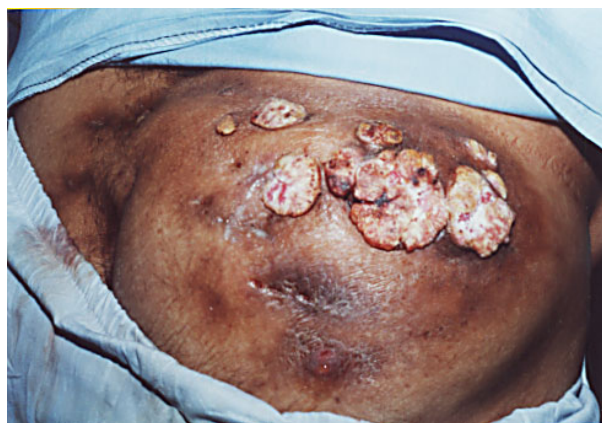
Figure 1. Verrucous carcinoma; white cauliflower lesions.

new lesions emerged at the same site and around it with multiple residual sinus formations. Pain or systemic symptoms were absent. About five months before presentation a series of cauliflower-like lesions appeared on the involved skin. Biopsy was taken, which revealed verrucous carcinoma (Figure 2). Biopsy was also taken from the depth of the lesion and cultured. Results showed that Paecilomyces sp (Figure 3) was present. E. coli grew on the bacterial culture. Laboratory results including CBC and ESR were normal. Mantoux test done by 5IU PPD-S was negative. The patient received ceftriaxone and ketoconazole and was scheduled for surgery.