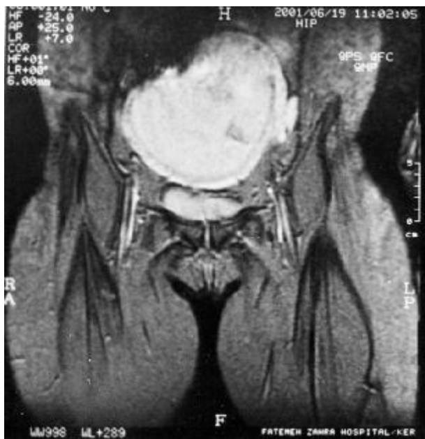
Figure 1. Magnetic resonance image of pelvis (coronal view) demonstrates normal anatomy.

radicular-type pain that may involve the legs, buttocks, perineal and perianal regions. Motor deficits, particularly of the lower neurons, and sensory deficits, generally asymmetrical, are common. Sphincter involvement is a late finding and is usually mild. 7 Similar symptoms can occur throughout a normal pregnancy, so there is potential for misdiagnosis and consequent delay in treatment. 8