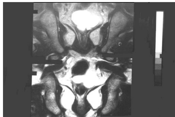
Figure 1. MRI (axial T 2 -weighted image), coronal cut just posterior to the urinary bladder, reveals a large septated left seminal vesicle cyst (Case 1).

Physical examination was unremarkable except for a soft cystic mass on the superior aspect of the prostate, found on digital rectal examination. Laboratory data including urinalysis and culture were unremarkable. Renal and bladder ultrasonography showed normal kidneys, bladder, and prostate with a seminal vesicle cyst on the left side (51 × 72 mm) which was confirmed by transrectal ultrasonography and magnetic resonance imaging (MRI) (Figure 1). Cystoscopy showed bulging of the bladder base and normal