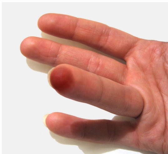
Figure 1. Pigmented Bowen's disease: Hyperpigmented patch on the pulp of the right fourth finger.

A skin biopsy was taken with the clinical suspicion of malignant melanoma. The specimen was then fixed, paraffin-embedded, and then stained with hematoxylin and eosin. Microscopic examination of the specimen revealed diffuse full-thickness keratinocytic atypia with loss of polarity, atypical mitotic figures, and many dyskeratotic cells as well as vacuolization of the keratinocytes of the upper epidermis (Figures 2 and 3). There was regular acanthosis with diffuse hyperkeratosis and thickening of elongated rete ridges. The papillary and subpapillary dermis were fibrotic and the vessels showed wall thickening. The histological pattern was compatible with the diagnosis of pigmented BD. Surgical treatment