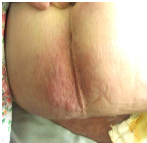
Figure 1. Skin lesions of metastatic adenocarcinoma of the ovary.

abnormality. Computed tomography and magnetic resonance imaging of the liver, spleen, and other organs were normal. The patient received combination chemotherapy with cisplatin and paclitaxel, but she did not improve and died about one month later.