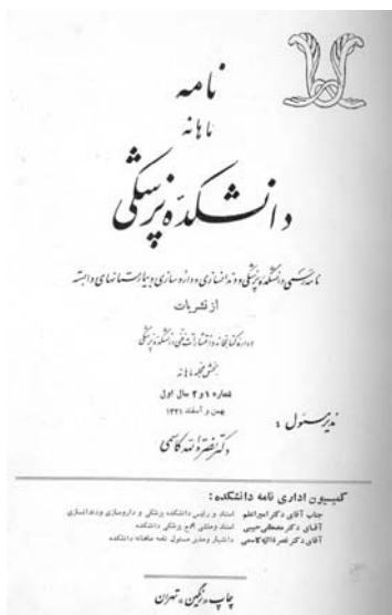
Figure 2. The front cover of the first issue of the Journal.