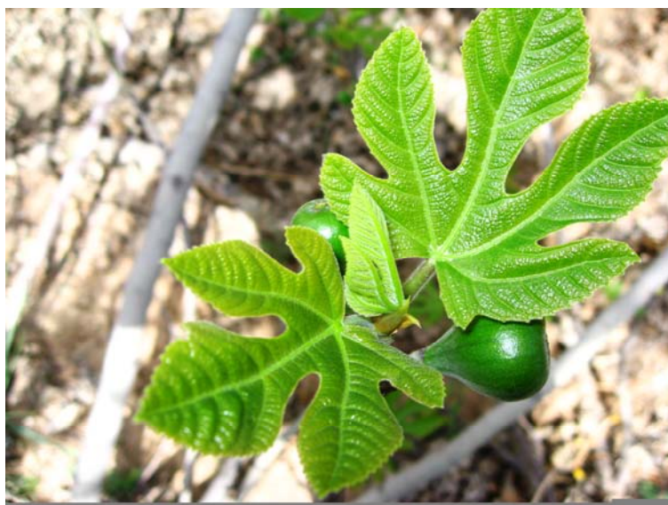
The leaf and fruit of common fig tree ( Ficus carica) in Estahban, Fars Province, 160 km from Shiraz.

Ficin, a proteolytic enzyme isolated from figs ( Ficus carica , globata and doliaria ); used as an anthelmintic and in industry as a protein digestant (P: 584, Stedman's Medical Dictionary, 25 th Edition, Williams and Wilkins, 1990)