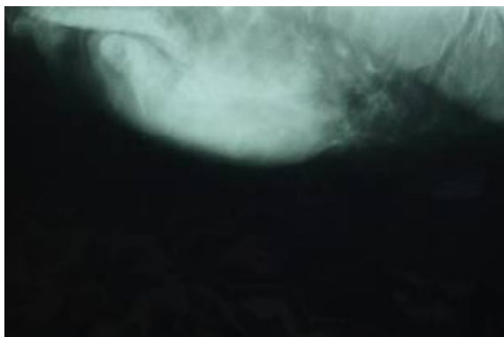
Figure 1. Standard mammogram of the right breast.

ipsilateral axillary lymph nodes was performed. The histopathologic diagnosis was invasive ductal carcinoma in both breasts (Figure 2).